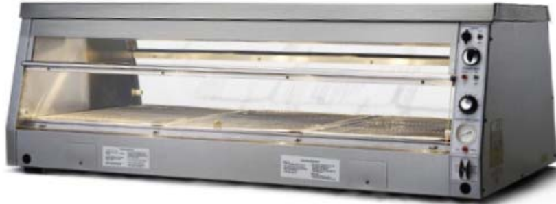
Single-tier humidified display counter warmer, model HCW-3 with flip-up pass-through doors.

MODEL HCW-3 single tier 3-pan HCS-5 single tier 5-pan